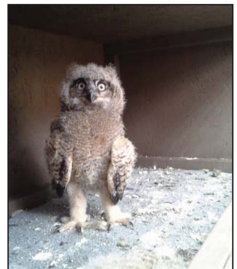
Young owlet safe inside nest box in new enclosure