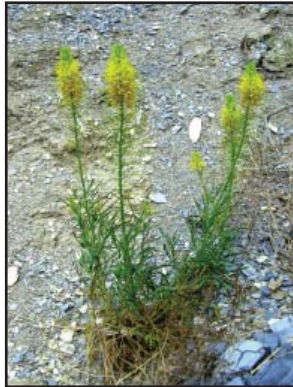
Prince's Plume - Stanleya pinnata

Learn to identify native plants around NRCP from Colorado Native Plant Masters. You'll learn about these plants in the field, and discover their ecological relationships with other plants and animals. You will also learn how these native plants can become part of a sustainable home landscape that saves water and avoids pollution from fertilizers and other chemicals. There will be 2 meetings, one in June and one in July, so we can catch the different blooming cycles of different native plants.