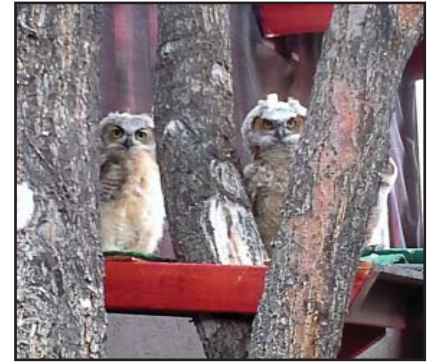
Owlets enjoying the tree in their new enclosure